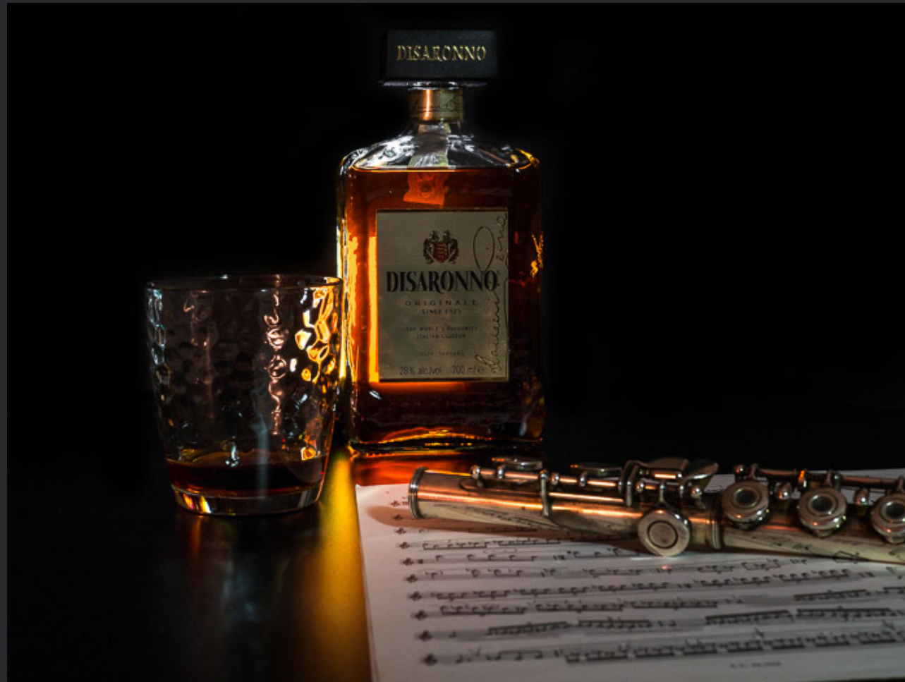
DISARONNO » https://expertphotography.com/complete-guide-still-life-table-top-photography/