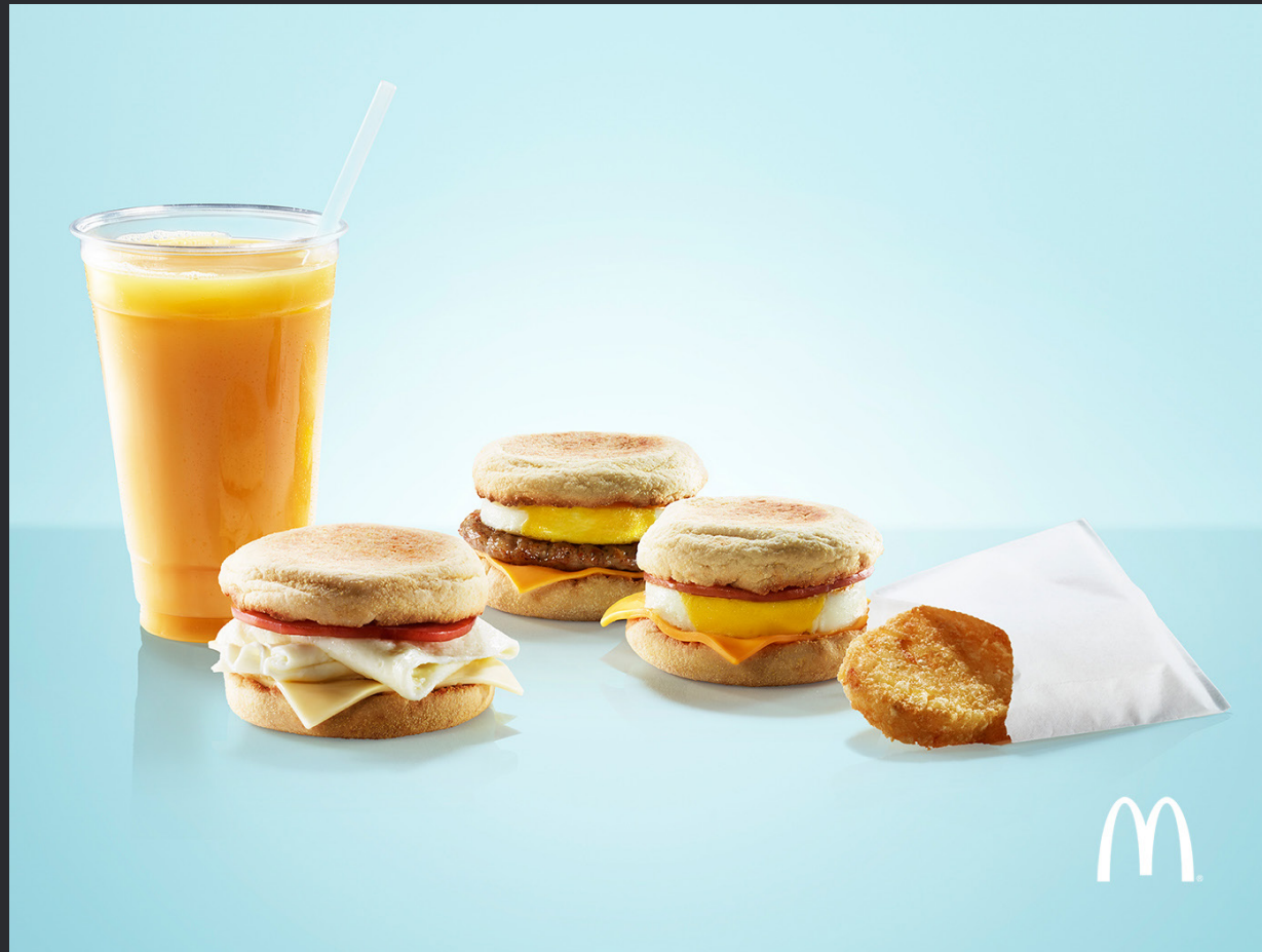
MCDONALD'S BREAKFAST » http://www.annabellebreakey.com/?attachment_id=2083